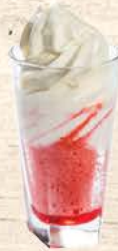
ICEE FLOAT 8.99