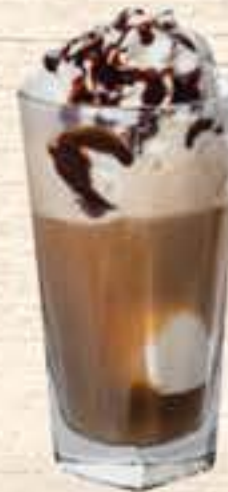
COFFEE FLOAT 7.99