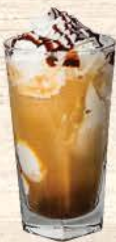
BEER FLOAT 13.89